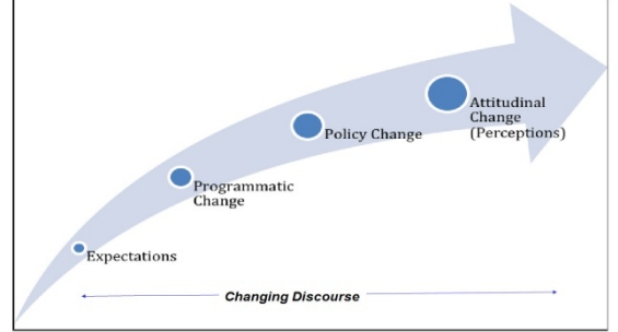
Figure 3. Processes of influencing change over time